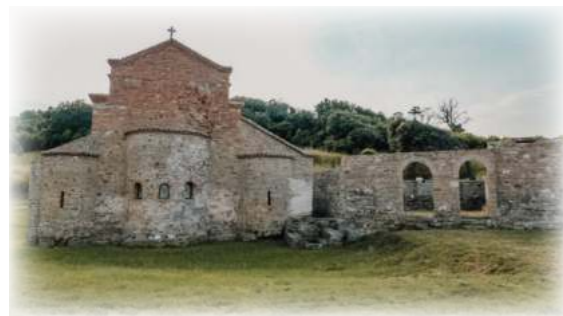
The Church of St. Ndou (Cape Rodon)

TourAZZO project aims to promote the sustainable valorisation and preservation of cultural heritage as growth assets in the Municipality of Durrës.