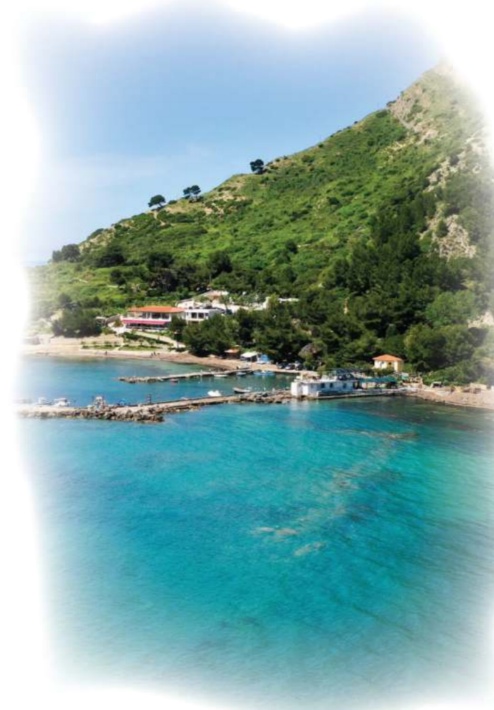
The Currila Beach

For more information on this project please refer to: