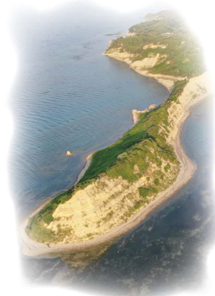
The Cape and Falezha of Rodon