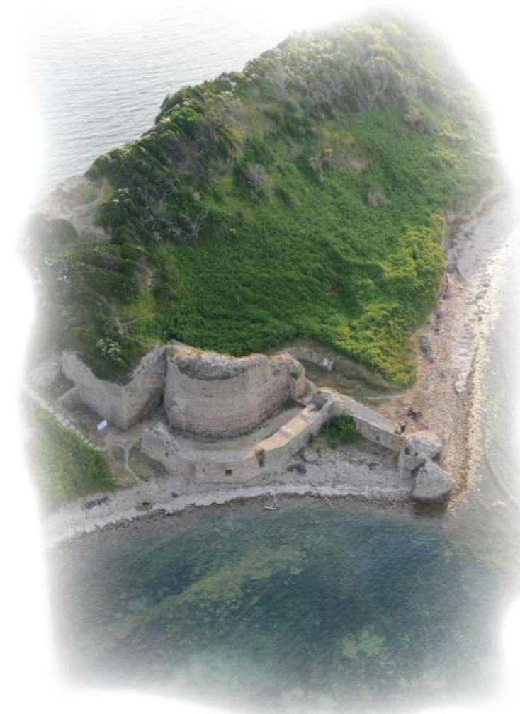
The Rodon Castle

This product was produced by ESN AL Centre under the EU4Culture programme financed by the European Union and implemented by UNOPS in cooperation with the Ministry of Culture. Its content is the sole responsibility of ESN AL and does not necessarily reflect the views of the European Union and /or UNOPS.