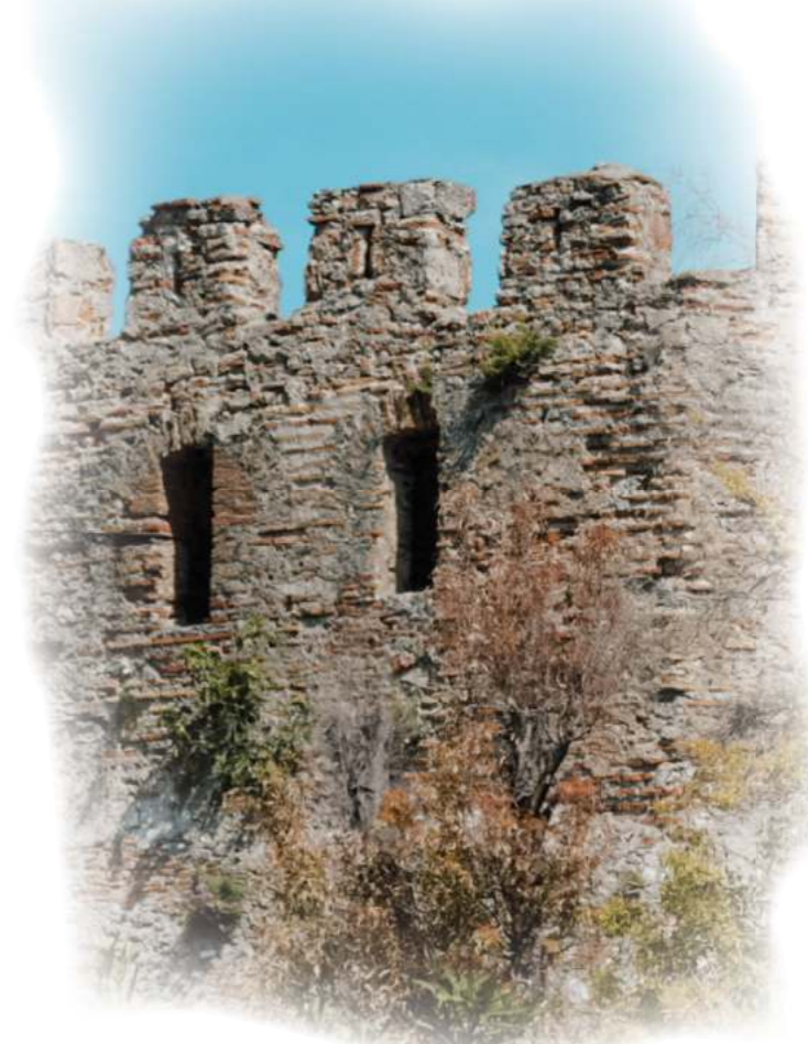
The Castle of Durrës

TourAZZO project aims to promote the sustainable valorisation and preservation of cultural heritage as growth assets in the Municipality of Durrës.